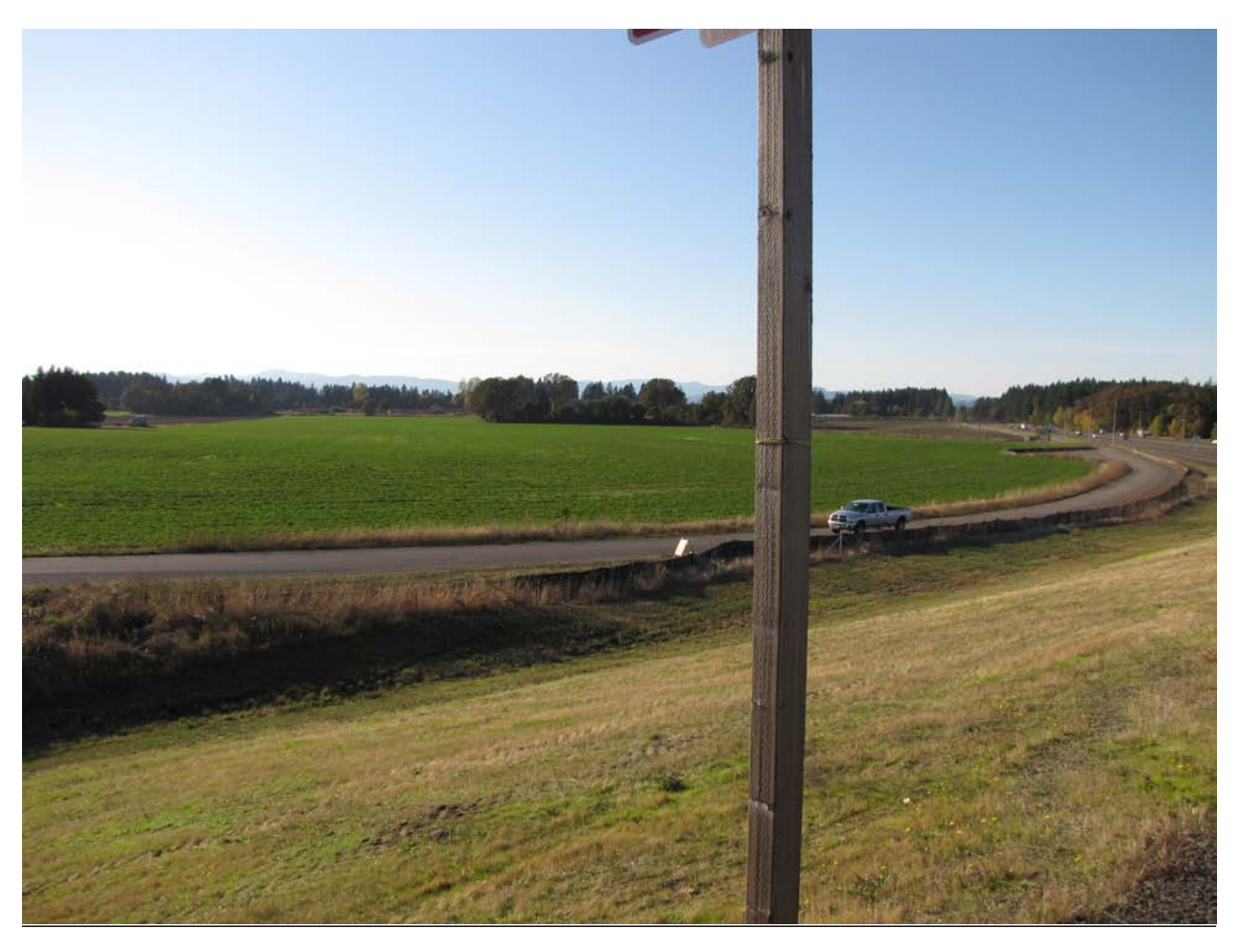
Figure 4 - Field on Southwest Side of Highway 26 and Jackson School Road Interchange

<u>http://www.oregonmufon.com/index.php?</u> <u>option=com_content&view=article&id=77:sunset-highway-crop-formation&catid=44:crop-circles&Itemid=75</u>