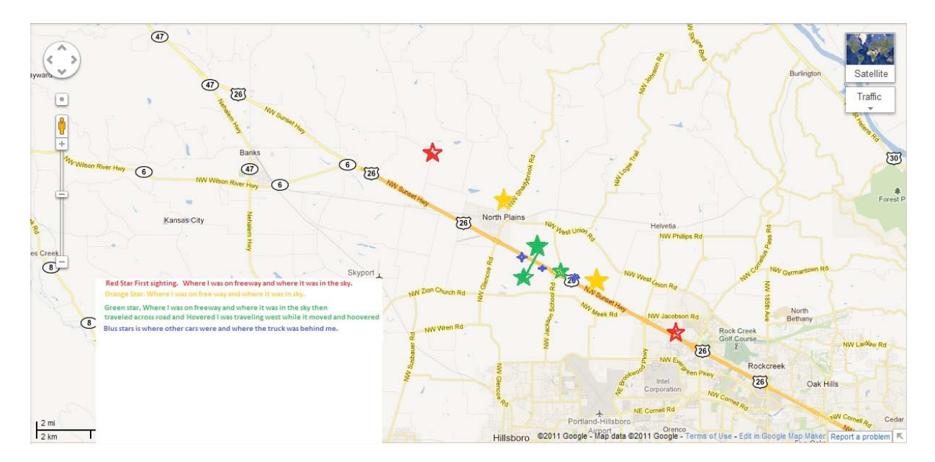
Figure 2 - Witness Map

that her name and her daughter's name, as well as their contact information, were visible to only the state director and assistant state director plus the two investigators (the primary and also the chief investigator for Oregon). He further reassured her that MUFON took her privacy and the privacy of all witnesses very seriously, adding that her name would not be included in any report about this case without her permission.