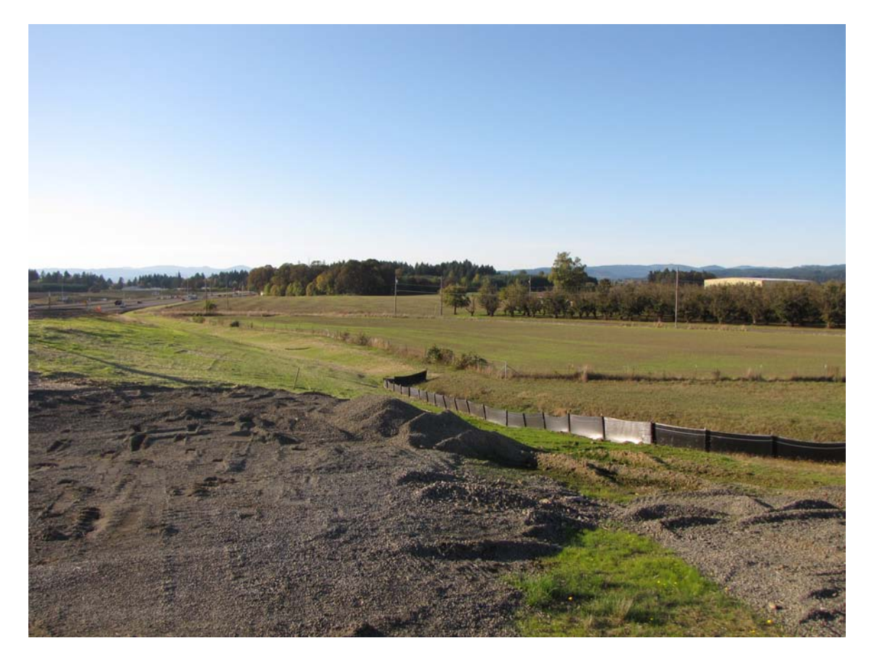
Figure 3 - Field on Northwest Side of Highway 26 and Jackson School Road Interchange

As a curiosity note, while the primary investigator was photographing the area on the southwest side of the Highway 26 and Jackson School Road interchange, a black helicopter flew toward the investigator, and then disappeared to the south. This was more a source of amusement than anything else, since the approach path of the chopper in question was directly from the nearby Hillsboro Airport.