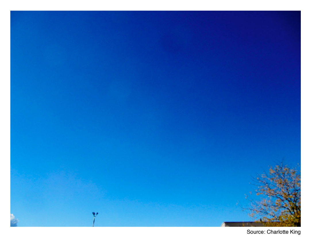
Figure 3. Charlotte's Second Photo

This is Charlotte's second photo taken about 30 seconds after the first one. It does not show any trace of the UFO shown in the first photo in Figure 2, Charlotte's First Photo. However, Charlotte's second photo here does show, on inspection in Photoshop somewhat, four large, anomalous, amorphous, circular patches in the sky. (Unfortunately, they do not show up well here at all.) Three of them run at a diagonal from the upper left to the central lower right. The fourth one can barely be seen in the upper central part of the photo as a somewhat darker patch about the same size as the lighter ones. The photo has been manipulated to bring more contrast to these anomalies. It is full frame. (See The Second Photo under Analysis later.)