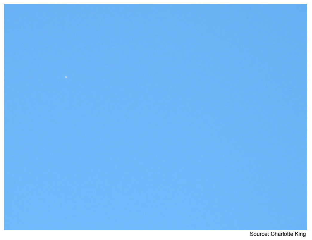
Figure 2. Charlotte's First Photo

This photo is a full frame photo showing the tiny UFO in the upper left quadrant as a white dot. For a blow up of the UFO, see Figure 4, Photoshop Blowup and Manipulation to Bring Out Shape. This photo is unmanipulated.