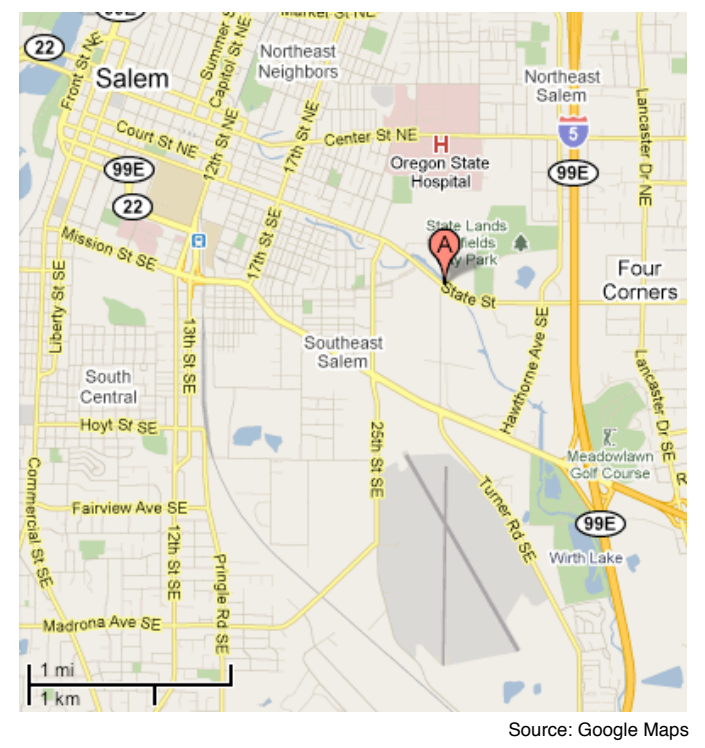
Figure 4. Central Salem, Oregon, Environs

Charlotte's sighting at State Street and Airport Road SE is about a mile north of the Salem Municipal Airport. The sighting took place where the "A" marker is on the map.